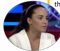
Goriz Alumni Tatevik Revazian Head of the Civil Aviation Committee of Armenia

“thanks to Goriz, I became exposed to people from different countries, evolving in different cultures, but still facing the same issues. This allowed me to view these from a different perspective”